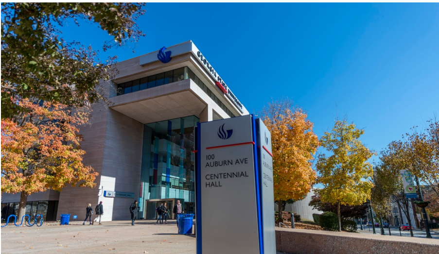
Georgia State University campus during the Fall Semester.